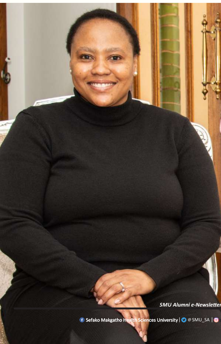
SMU Alumni e-Newsletter

Basically it should not be difficult if you are a black man who come from this country. We come from a history where the politics disadvantaged us. We are living in a democracy that disadvantages others even further. So I think that alumni should find it easy to come in and build up a funding system at SMU to help others because it is unfortunate you know democracy is a great thing that came to us in 1994 but it has not borne the fruits and advantage we thought it would do.